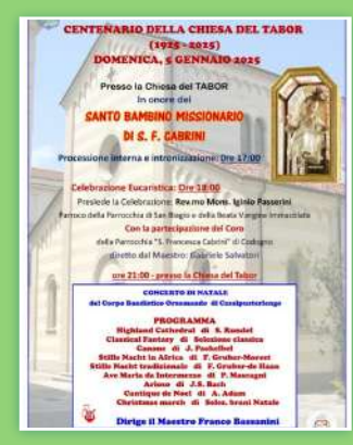
Poster for the January 5 event at Tabor Church.