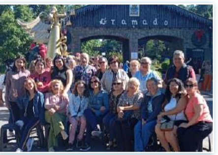
Educational team at the College of San Lorenzo in Paraguay.

* At the beginning of each year, in January, the MSCs in Nicaragua perform a special mission of going out and sharing the Gospel in