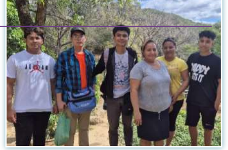
Mission to the countryside in the community of La Danta in Nicaragua.