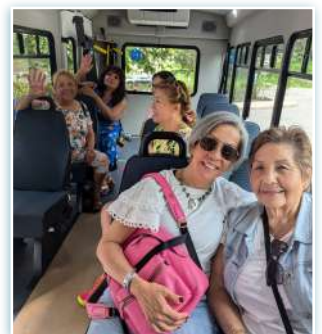
Visit to S. Cabrini Nursing Home by CIS-NYC group.