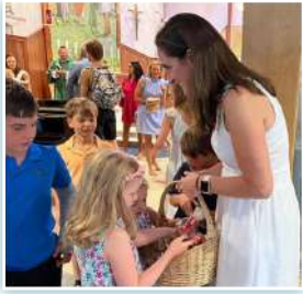
Distribution of candy at the Shrine in Colorado.

The celebration was streamed live, allowing the whole world to participate. On July 15, the Our Lady of Grace Community in Teresina, Brazil, also celebrated the anniversary of St. Frances Cabrini's birth. The sisters gathered with the local community to pray and celebrate this significant date.