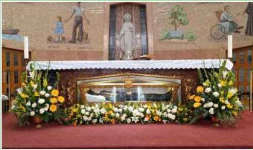
Decorations on the altar of the Sanctuary.