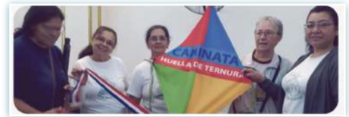
Walk against child and adolescent violence in Paraguay.