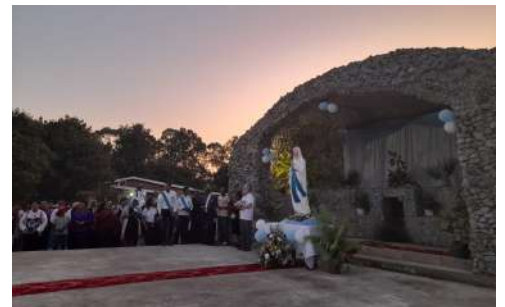
A shot during the vigil for the Feast of the Assumption of Mary in eSwatini.

A time of prayer was observed on August 15 at the Shrine in Denver, Colorado and it was also a special day at Cabrini High School in New Orleans. During the Mass celebrating the Feast of the Assumption of the Blessed Virgin Mary, new students, faculty and staff received their Cabrini pins symbolizing their role in our community. The Class of 2025 received a special Cabrini rosary.