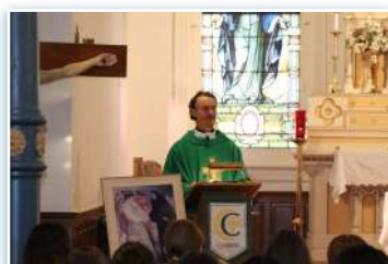
S. Mass at Cabrini High School New Orleans.

* August in Brazil was the month dedicated to vocations with several