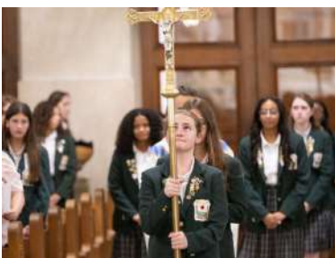
S. Mass at Cabrini High School New Orleans.

On July 7 we celebrated 78 years since the Canonization of Mother Cabrini!