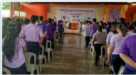
La Inmaculada Technical Institute Mass, Nicaragua.