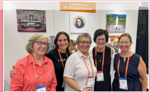
Some shrine representatives at booth 1150 of the Eucharistic Convention.