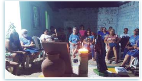
Our Lady of Grace Community in Teresina, Brazil.

The celebration was streamed live, allowing the whole world to participate. On July 15, the Our Lady of Grace Community in Teresina, Brazil, also celebrated the anniversary of St. Frances Cabrini's birth. The sisters gathered with the local community to pray and celebrate this significant date.