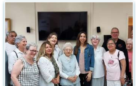
Celebrations in the New York Shrine.