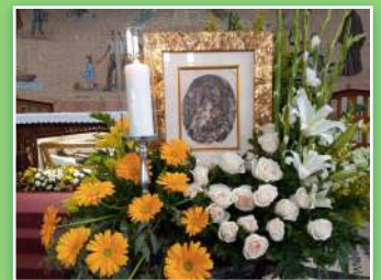
Decorations on the Sanctuary ambo.