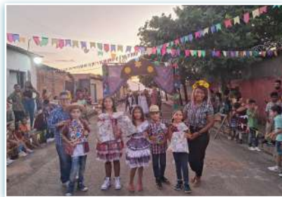
Cabrini's "Arraia" party.

* On July 18 during the “Arraia da Cabrini” celebration at the Santa Cabrini Youth Center in Brazil, prizes were awarded to the winners of the writing and drawing contest on the theme of child labor.