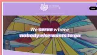
Home page of the new site.