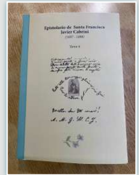
The VI tome of the Epistolary.