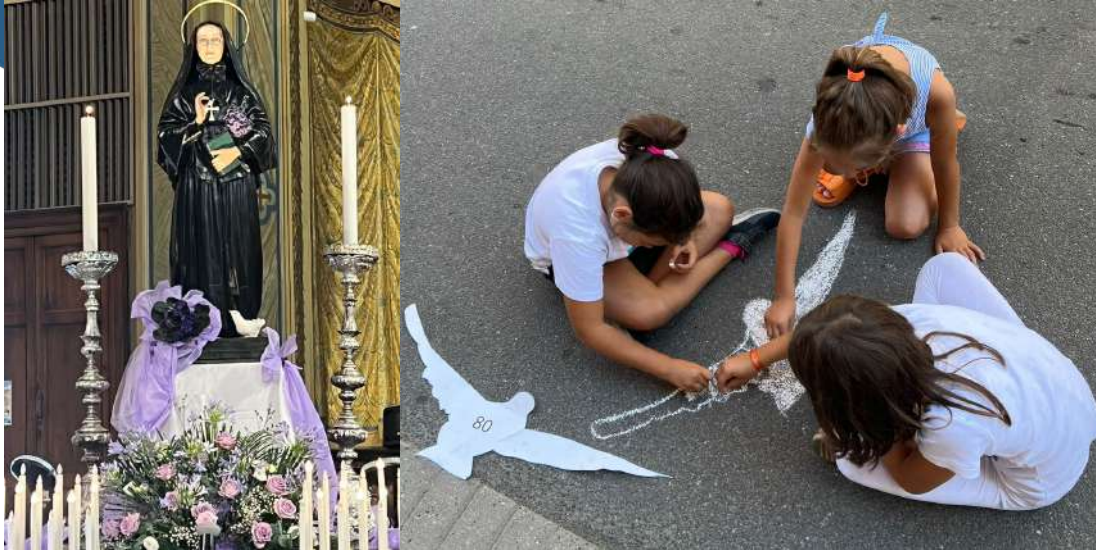
In this box the image of doves in the streets of Codogno and the statue of Mother Cabrini at the Basilica of Sant'Angelo Lodigiano.

Missionaries of the Sacred Heart of Jesus | July- August 2024 | www.cabriniworld.org